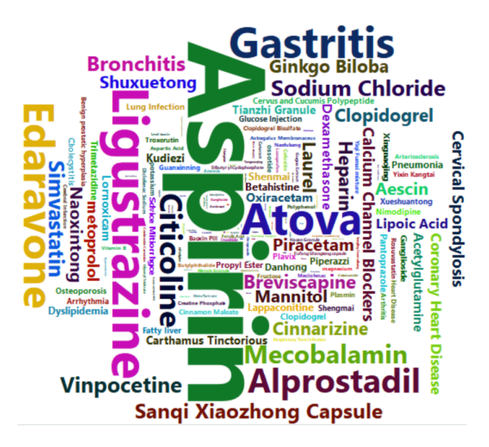
Figure 2: Medical Codes Cloud Graph

4 Demonstrate the effectiveness of multiple machine intelligence methods in clinical prediction tasks and give recommendations based on the procedure elapsed time and prediction performance.